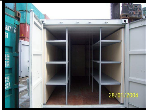
20' x 8' ISO Container Paint Stores - Exterior