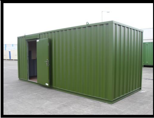
20' x 8' Workshop Stores - Exterior